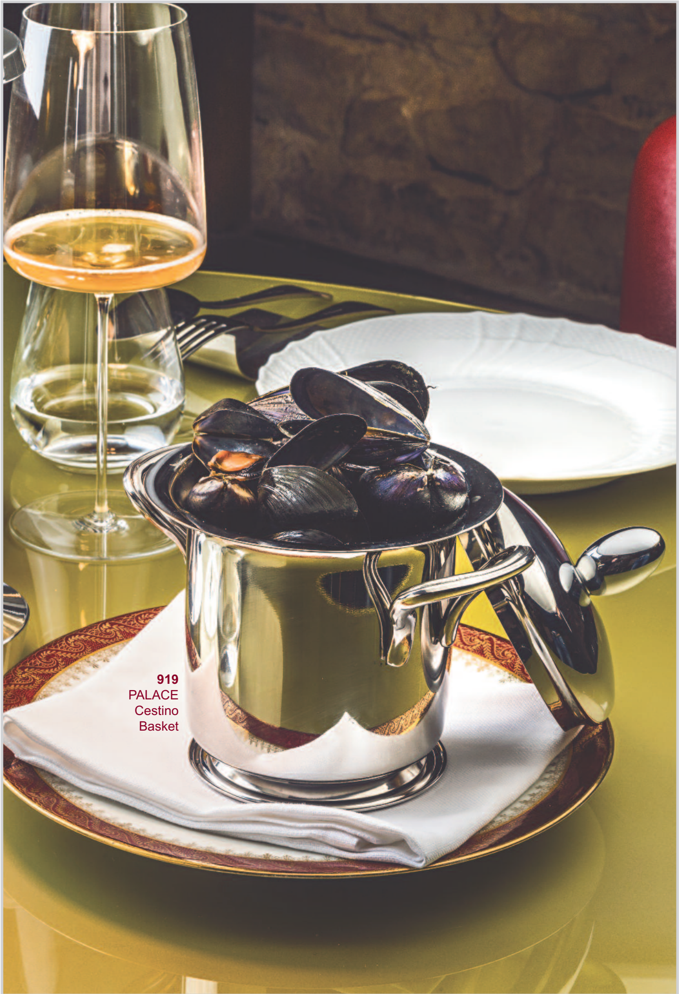
919 PALACE Cestino Basket