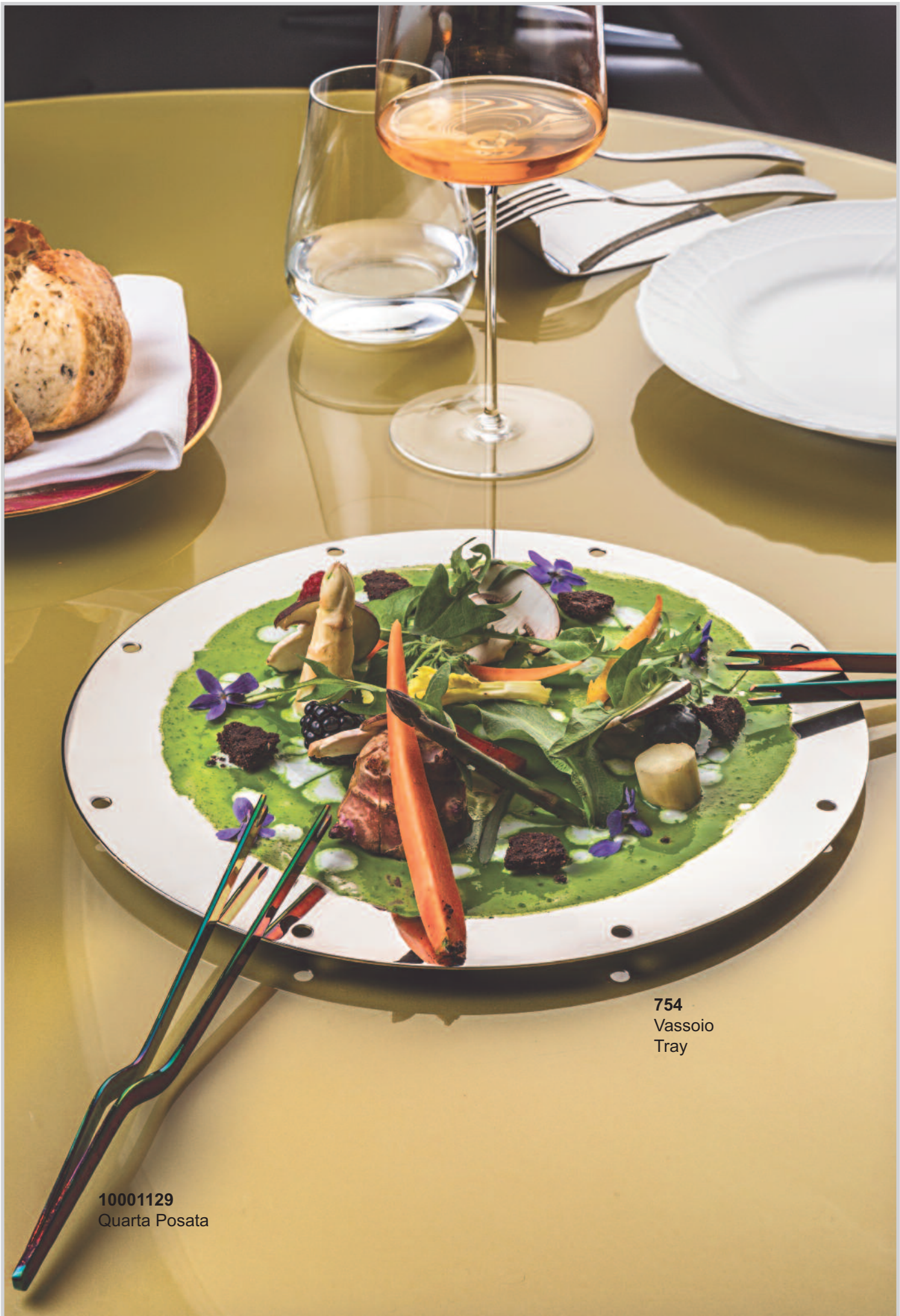
10001129 Quarta Posata